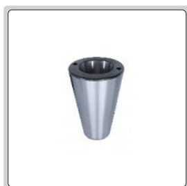
BT50/BT40 converter (optional)