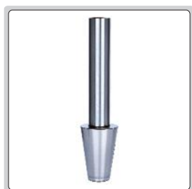
standard rod (included)