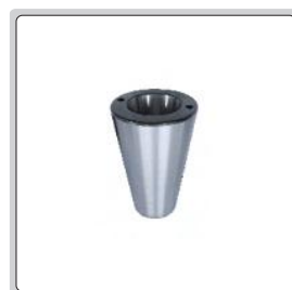
BT50/BT30 converter (optional)